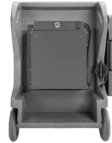
CMBH1826L (Hot Only)