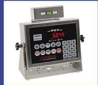
Optional checkweigher light bar for model 210.