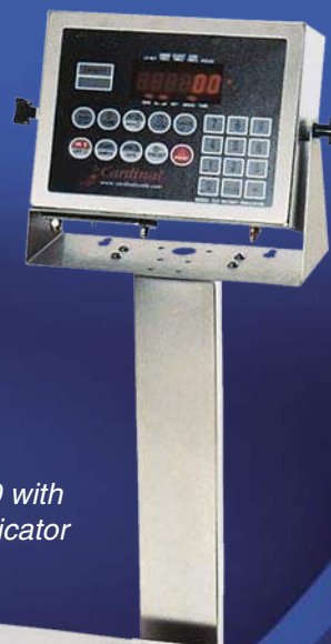
EB-300 with 210 Indicator