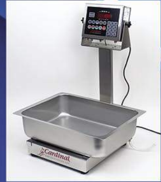
Optional commodity pan with built-in drain.

Whatever your needs may be, select from Cardinal's complete line of stainless steel bench scales.