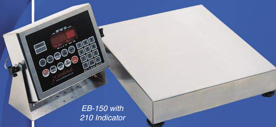
EB-150 with 210 Indicator

Designed for top performance and long-term accuracy.