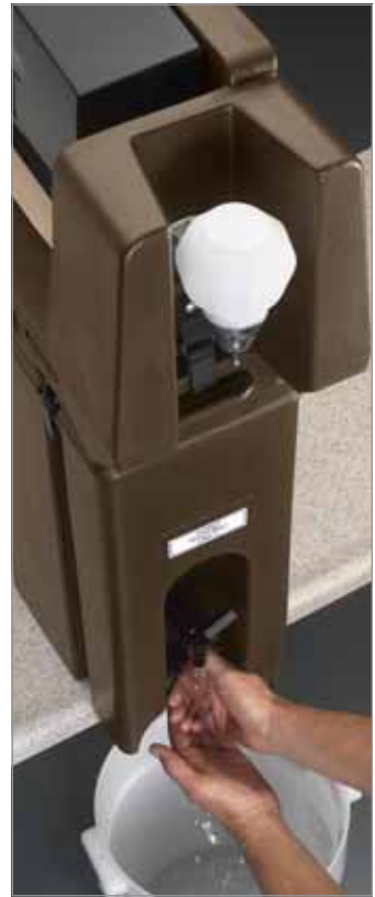
Shown with 500LCD Camtainer®.