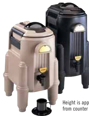
CSR5 Shown in Black.

Height is approximately 7" from counter to spigot.