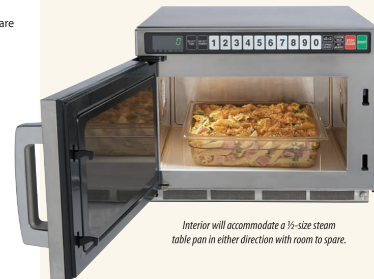
Interior will accommodate a 1/2-size steam table pan in either direction with room to spare.

With larger capacities and higher output wattages, these models are designed to work hard and keep long hours. They're the perfect help in your kitchen.