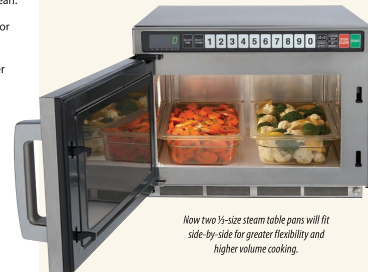
Now two 1/3-size steam table pans will fit side-by-side for greater flexibility and higher volume cooking.