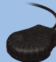
Foot Pedal (optional*)