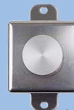
(optional*) Mountable Pushbutton