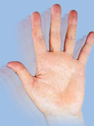
Lite Weigh Hands-Free