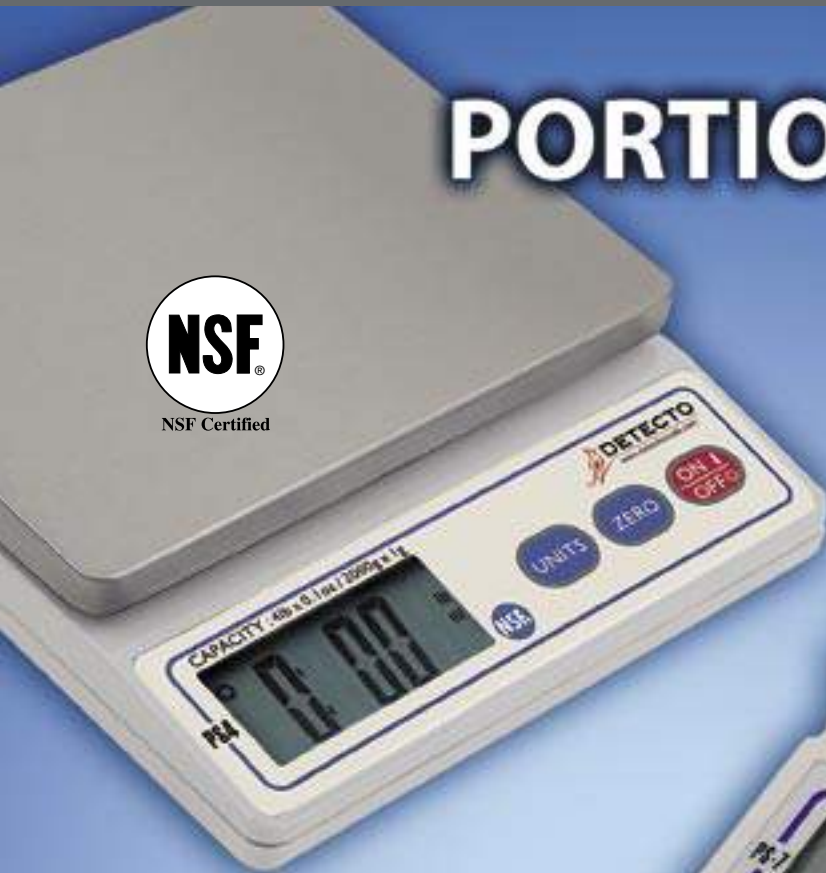
Model PS4 Scales Economical, 4 lb capacity with battery or AC power