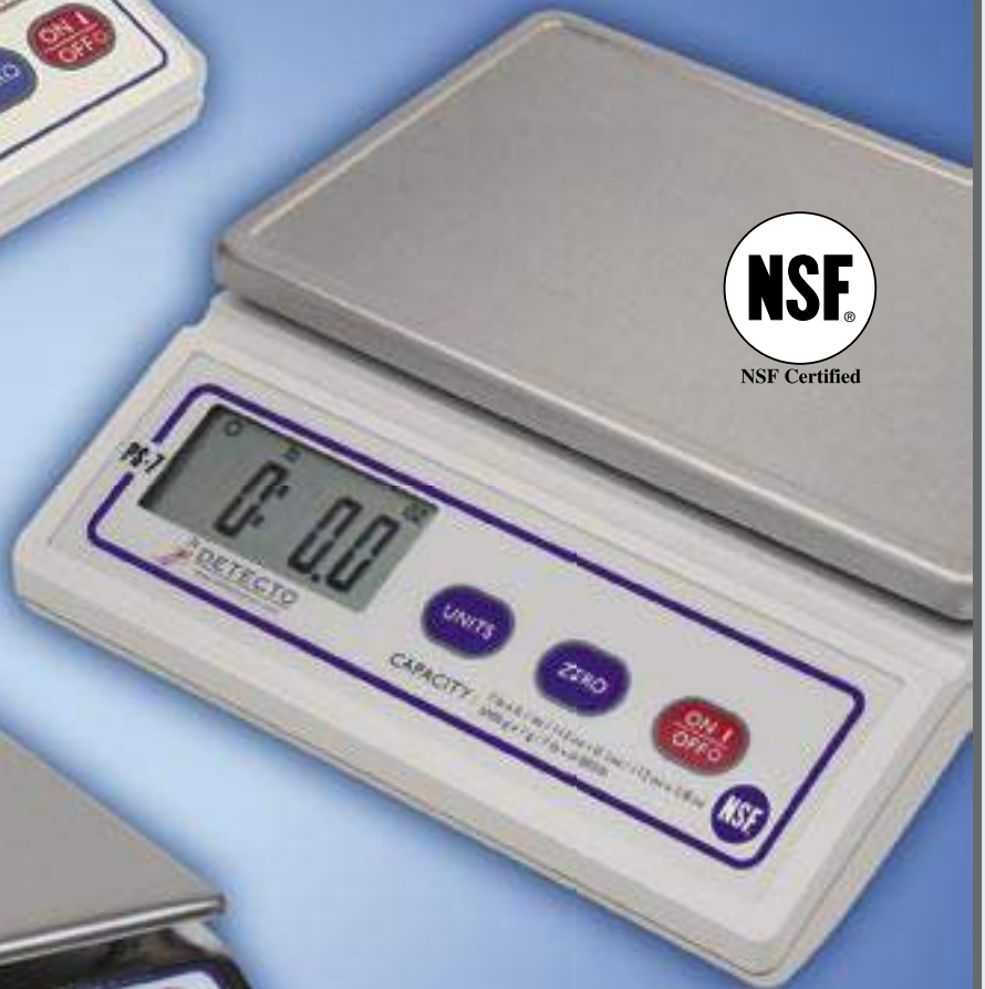
Model PS7 Scales 8" x 5" platter, 7 lb capacity with rechargeable battery or AC power