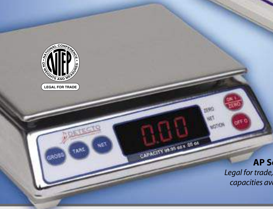
AP Series Scales Legal for trade, stainless steel, multiple capacities available with AC power

Use Wherever Food is Weighed, Portioned or Dispensed