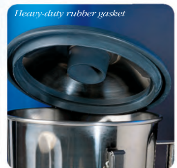
Heavy-duty rubber gasket