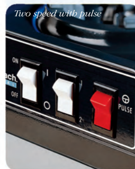
Two speed with pulse

A two year warranty provides protection that only the best can offer.