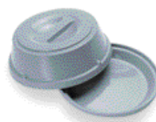
Heat Keeper for 9" Plate. Does not fit into Camcarrier for Heat Keepers.