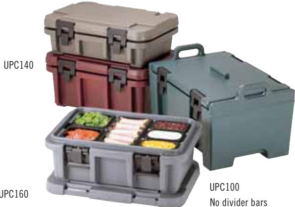
UPC140 UPC160 Shown with dividers and fractional sized food pans. UPC100 No divider bars available for UPC100.