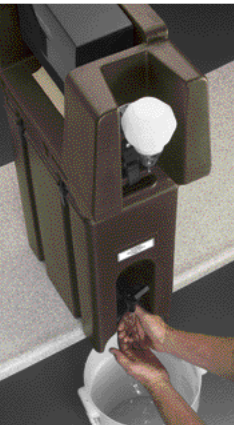
Shown with 500LCD Camtainer®

Set up a Cambro Handwashing Station anywhere using 2½ or 5 gal. Cambro Camtainers or Ultra Camtainers.