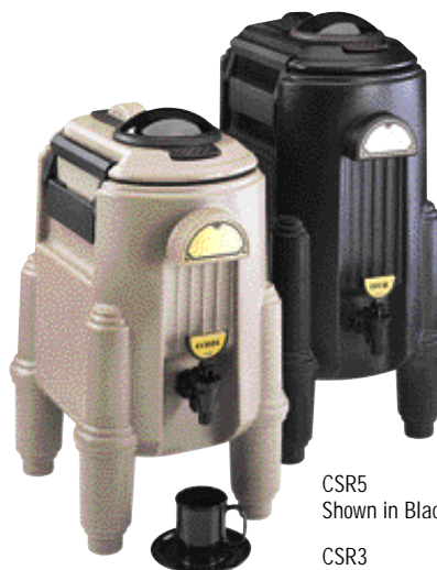
CSR5 Shown in Black

Two brass identity plates included: coffee/decaf or tea/hot water.